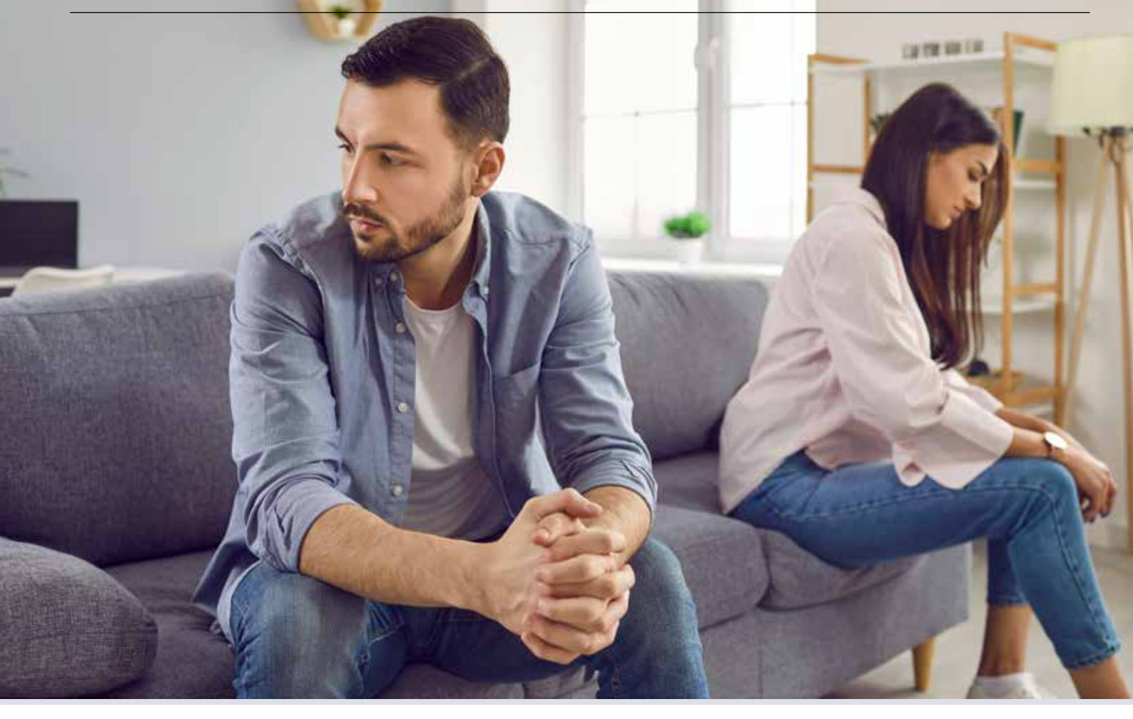
GUIDE TO FINANCIAL ADVICE DURING DIVORCE

empowering you to make informed decisions and plan confidently.